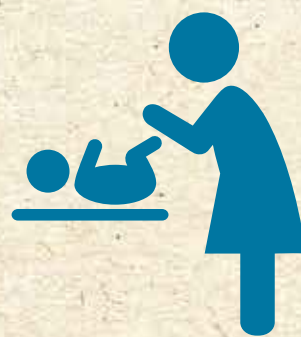
Difficulty caring for yourself or your baby