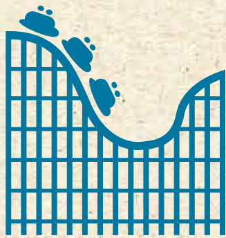
Extreme mood swings