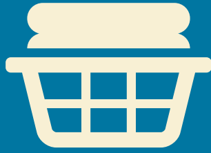
Dozens of loads of laundry