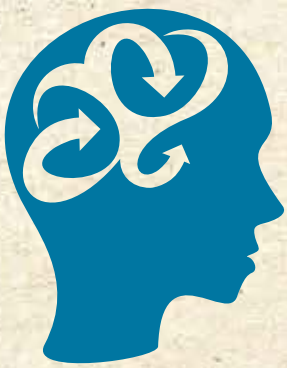
Intense anger, worry, or unhappiness

If you're like many pregnant women, nothing could be further from your mind. But depression and anxiety can happen before or after birth. Learn these signs.