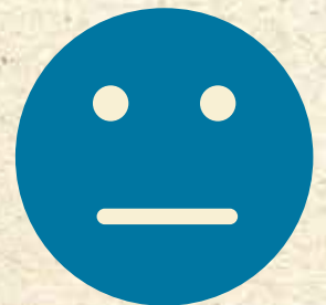
Less interest in things you used to enjoy